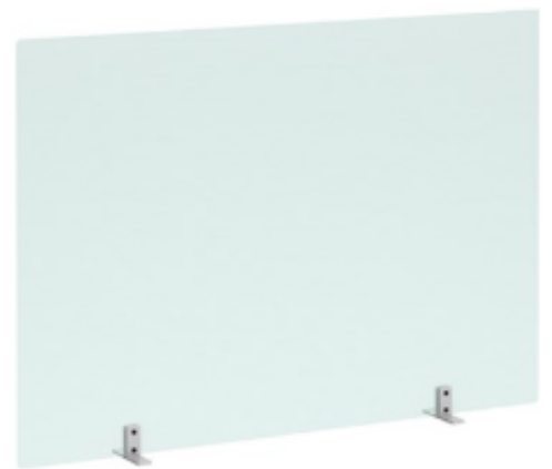
Acrylic high screen From £190.95