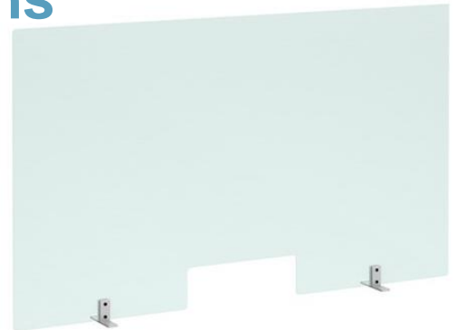
Acrylic high screen with cut out From £214.95

Direct delivery from the supplier, up to 8 weeks currently.